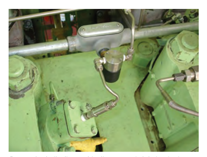
Pneumatic air distributor with pilot-actuated air-in-head valve

Installation of the SaveAir system on engines with an existing pneumatic air distributor (OEM or aftermarket) and pilot actuated in-head starting valve represents the least complex installation requirements to the user.