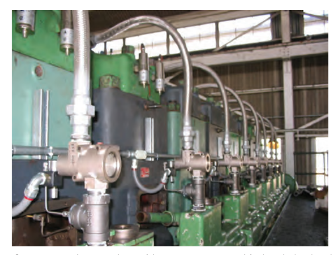
Cam actuated start valves with pressure-actuated in-head check valves

Retrofit requires the removal of the mechanical/pneumatic air-start distributor, and all of the associated air tubing to the existing air-start valves. The SaveAir Distributor is mounted on the air distributor drive or other camshaft speed accessory drive, with the SaveAir Output and Display Modules mounted on the engine (the Display Module can also be mounted in the engine control panel). The electrically-actuated SaveAir solenoids are mounted near each engine air-starting valve, with their pilot air drawn from the high volume starting air pipe local to each cylinder or via a small diameter starting air manifold running the length of the engine. Each solenoid admits the high pressure air charge into the associated cylinder to begin and maintain engine rotation.